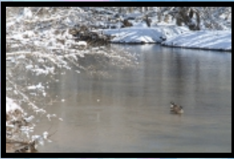
Snow melting near Piney Orchard