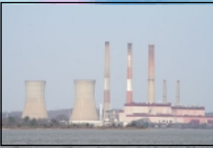
The Patuxent Chalk Point would be one of several power plants effected by SB-154