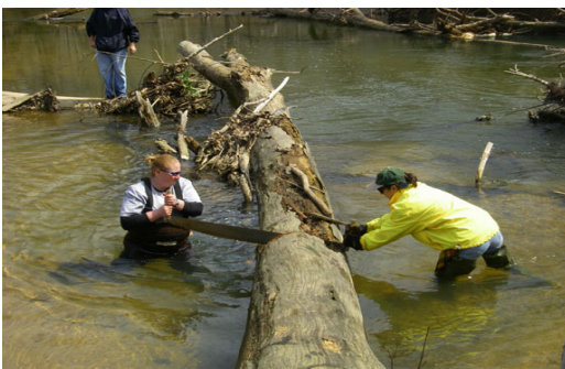
Roughnecks notching a river blockage