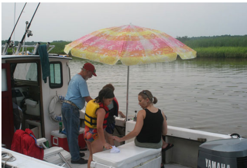
Sojourners take a shade break aboard the Crazy Loon