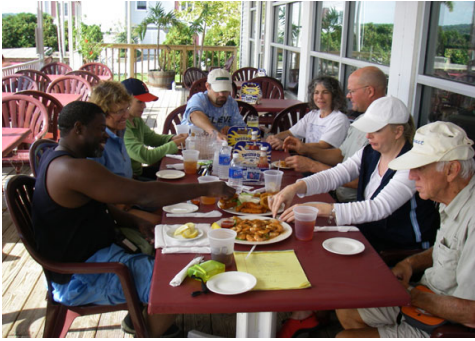
Dining in Port Deposit after a paddle