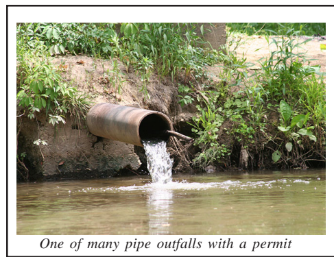
One of many pipe outfalls with a permit

The Patuxent River, like most of our natural resources, is a casualty of many root problems. This can be challenging for advocates who want to see progress that can be measured and outcomes that can be replicated elsewhere. In the five years of Patuxent Riverkeeper's existence, the organization has worked on numerous water quality issues only to find too often that many of the pollution problems are actually from sources that have permits which are not complied with or enforced. We thought it would make a difference in water quality if we develop a running list of well established permit violators and then use the citizen lawsuit provisions of the Federal Clean Water Act to challenge, notify and if necessary litigate to compel these violators to comply with the law. Our initial criteria is to target and publicly name ten facilities that contribute large amounts of point source pollution (waste that comes directly out of a pipe) to our waters, chronically violate their permits and which, based on past performance, seem highly likely to continue to do so unless they are threatened with legal action. It's a simple formula, very inexpensive to research, and as violators exit the list, we will add new ones. We will also publish a list of the 10 most compliant facilities. (continued pg 3)