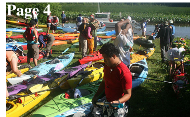
Page 4 Sojourners Get Ready!