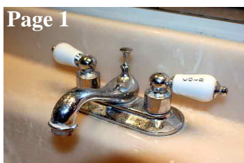
Page 1 Fly Ash in the Groundwater?