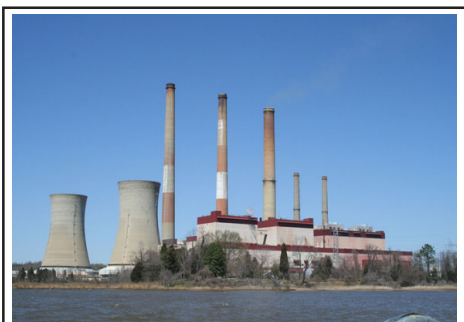
Chalk Point Power Plant

PrK and four other environmental organizations have filed a Clean Water Act notice of intent to sue Mirant, LLC for its coal fly ash disposal landfill in southern Prince George's County. Mirant uses the landfill in Brandywine to dispose of coal combustion by-products from its Chalk Point power generating facility, which is located on the banks of the Patuxent River. Mirant has supplied state authorities with written disclosures revealing that its monitoring well at the Brandywine facility shows contamination under