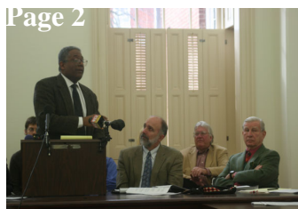
Page 2 Bay Scientists Speak Out