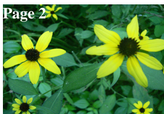
Page 2 The Spirit of the River