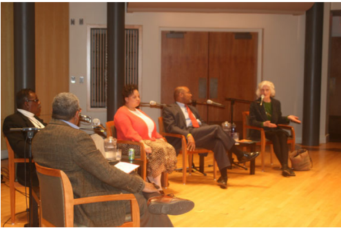
Environmental Justice Forum at UMD Earth Day 2009