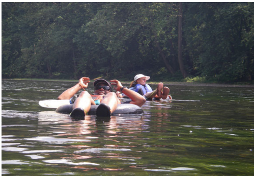
Tubing in Western Maryland